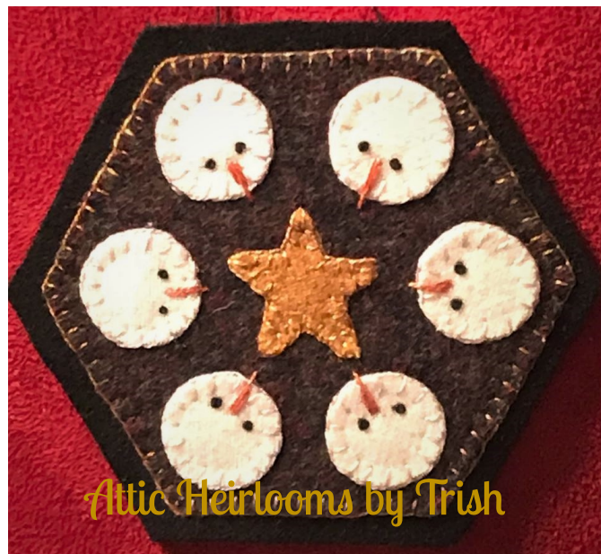
2018 March Ornament